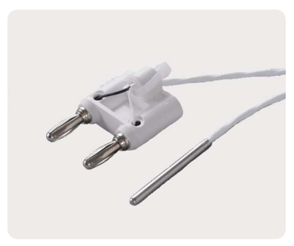
E2308A Thermistor Probe