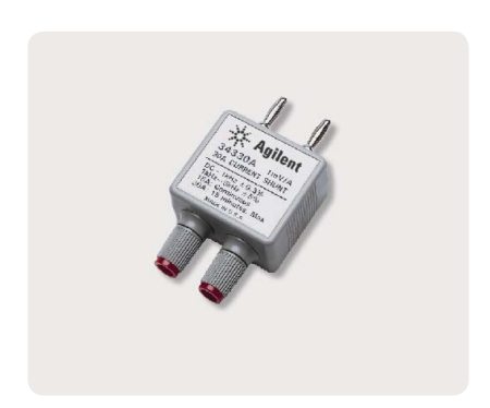
34330A 30A Current Shunt