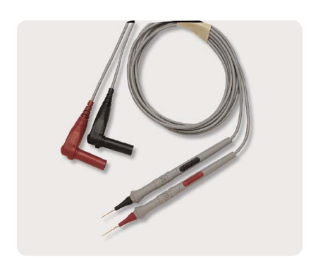
34133A Precision Electronics Test Leads